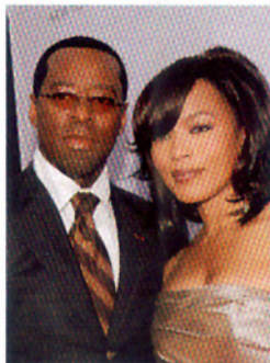
Proud parents Angela Bassett and Courtney B. Vance

With a new year just around the corner, strap in and brace yourself for another tabloid-driven celebrity ride.