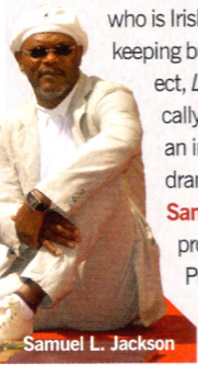
Samuel L. Jackson

who is Irish-Russian, the starlet is keeping busy with her next project, Lakeview Terrace . Ironically, she plays one-half of an interracial couple in the drama, which costars Samuel L. Jackson and is produced by the Fresh Prince himself. Trust, we're calling shots in Hollywood. Another shot caller, author